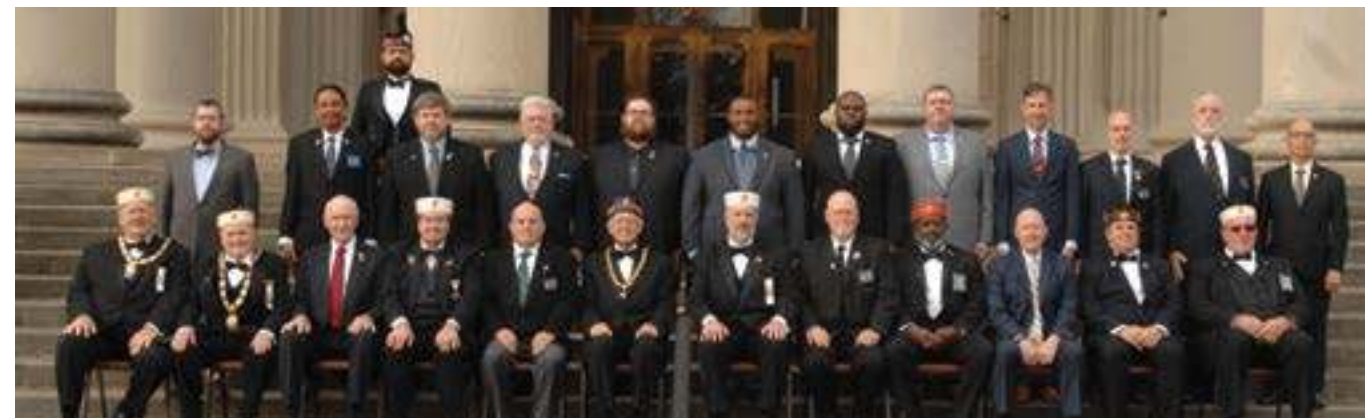
Ring Ceremony Fall 2023