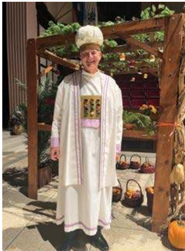
Feast of Tishri 2023