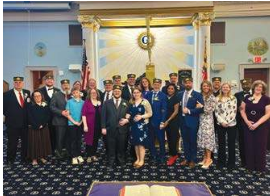
Twelve new members of the Valley of Cumberland – pictured here with their family members – were presented with Scottish Rite Prayer Caps and 14° Rings during the Spring 2024 Capping Ceremony.