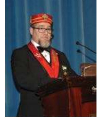
Valley of Baltimore Ring Ceremony Fall 2024